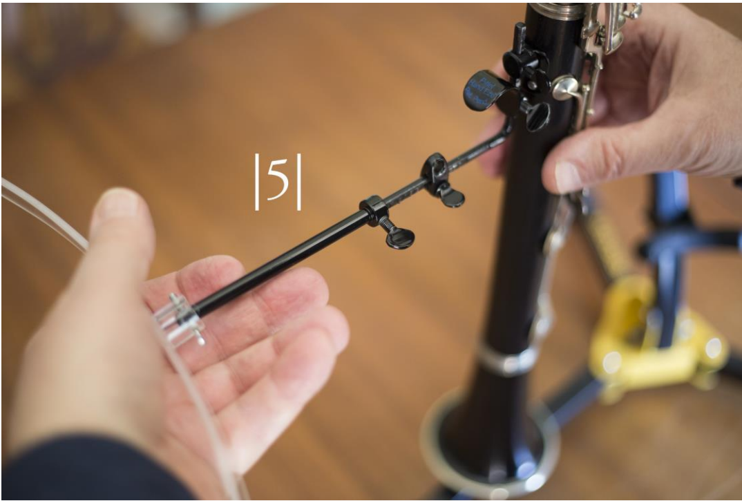
|5| Attach the Clear Body Rest Piece to remaining "rod" as shown.