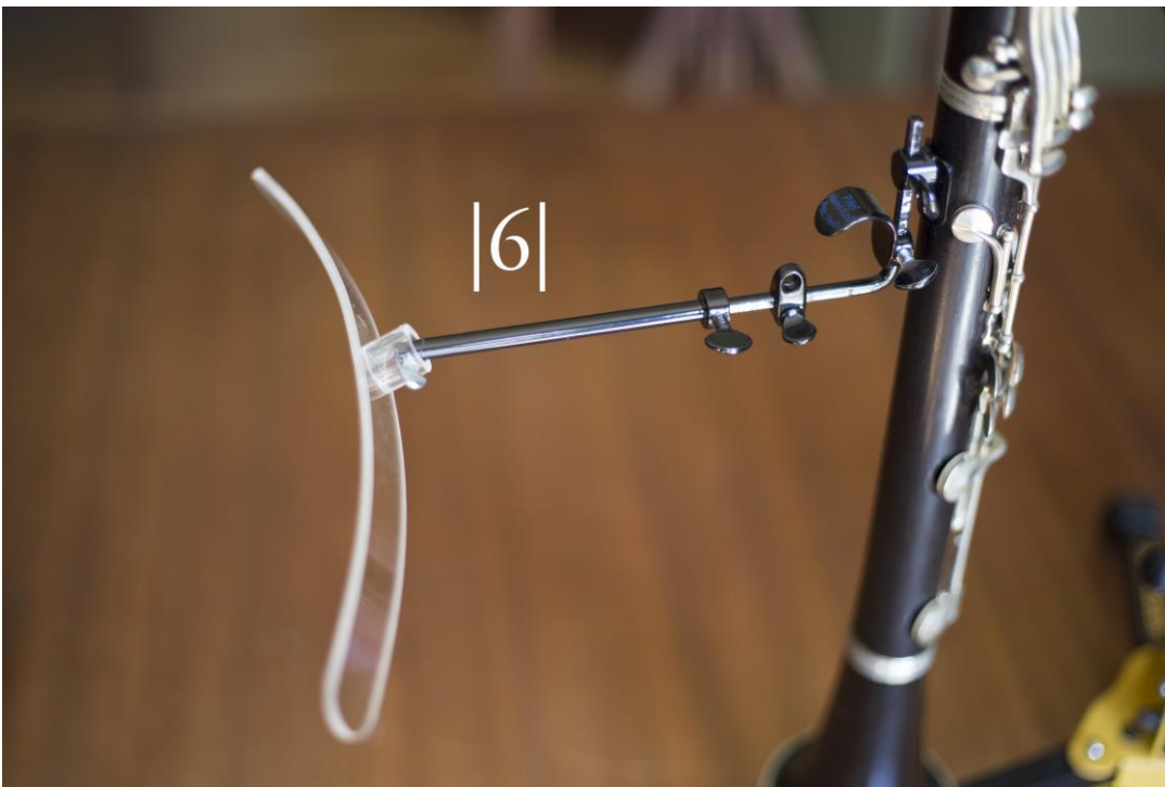
|6| Mount the Clear Body Rest Piece to right angle piece and tighten thumbscrew.