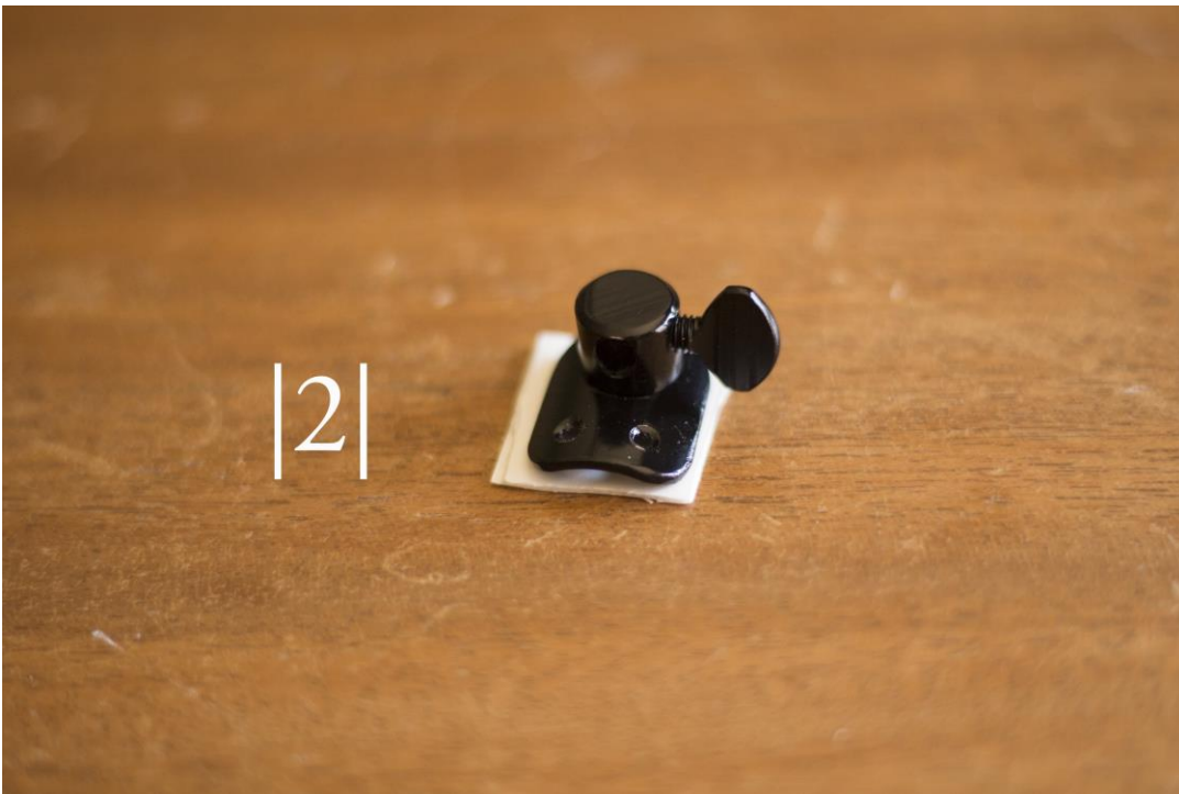
|2| Attach the "Hand Eze" receiver piece to body of instrument with double-sided adhesive, your original screws, or those included in the kit.