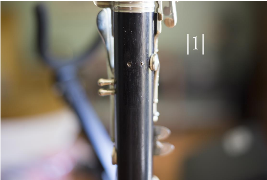
|1| Remove existing thumb rest.