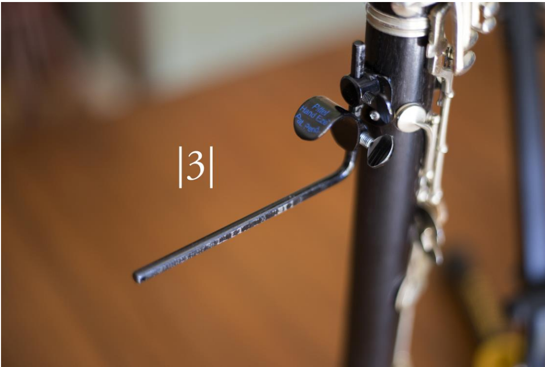
|3| Mount the thumb rest as shown. Insert right angle piece and tighten receiver piece thumbscrew.