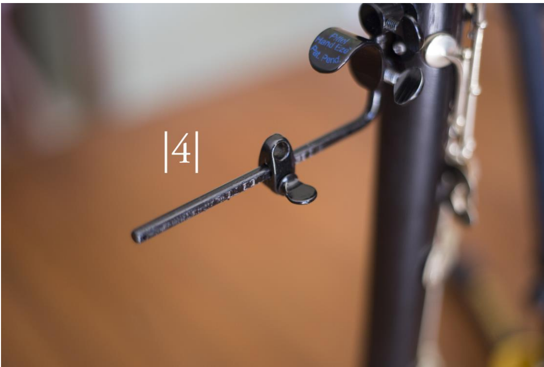
|4| Mount neck strap ring piece and tighten thumbscrew.